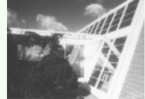
1st completely solar-heated commercial building in the world.

Minimizing energy use from fossil-fuel-generated sources through a variety of energy-conservation techniques helps reduce the use of our natural resources and the resultant pollution created by burning fossil fuels.