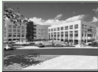
New 107,465 square-foot office complex utilizing GHP system.

The use of a geothermal heat pump (GHP) system meets several of the LEED credit categories. It is kind to the environment by using a renewable source of energy – the earth. The system is energy-efficient ; excess heat energy is stored in the earth for use at a later date. Using geothermal energy decreases demand on fossil fuels at power plants thereby reducing the emission of pollutants into the atmosphere. The system is water-efficient . Water taken from the ground is returned to the ground.